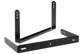
VERSATILE SPEAKER U-BRACKET